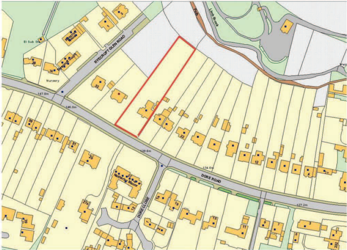
28, DORE ROAD LOCATION PLAN Not to scale